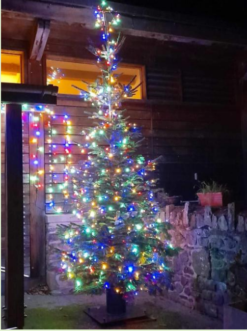
Codwyd coeden Nadolig gan y Cyngor Cymuned yn y Cartws Christmas tree erected by the Community Council at the Coach House

Darparodd y Cyngor goeden Nadolig a goleuadau yn y Cartws, a hefyd gosodwyd rhes o oleuadau dros y gysgodfan bws yng Nglanteifion. Roeddem yn falch iawn ail-gyflwyno'r goeden Nadolig ar Sgwâr Halkett, a bod yn un o noddwyr y digwyddiad Golau i Bawb a drefnwyd gan Hanes Llandoch/Y Cartws.