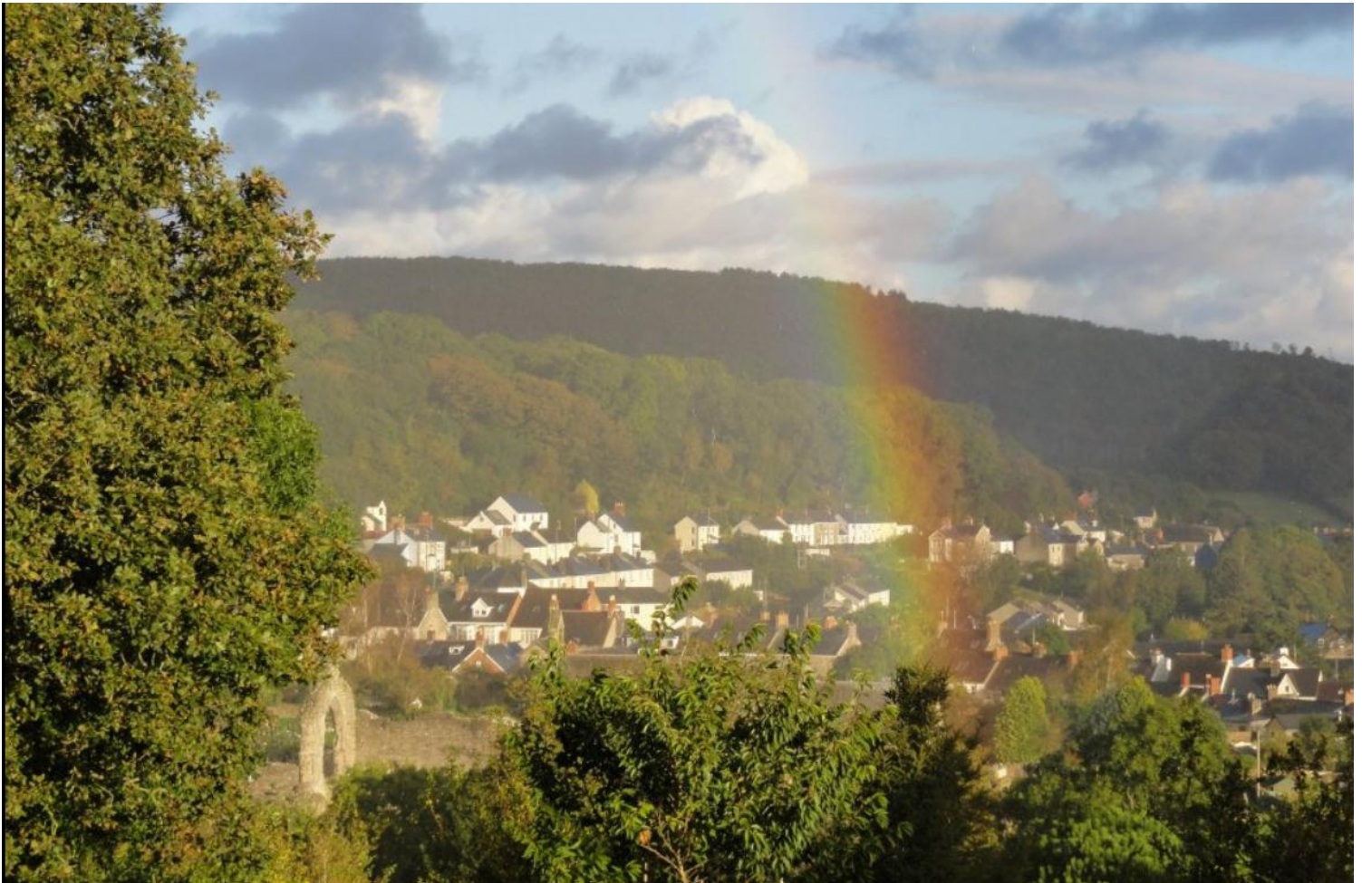
Golygfa ar draws Llandudoch / View across St Dogmaels.

Cyngor Cymuned Llandudoch St Dogmaels Community Council