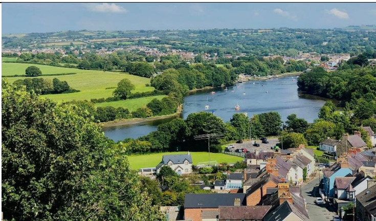
Golyfa ar draws Llandudoch / View across St Dogmaels.

If you have a group that might benefit from grant funding, please apply using the form available at: https://stdogmaelscc.gov.wales/grant-funding/